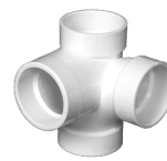
Part No. PVC 449 Sanitary Tee with 2" Left Hand Sanitary Inlet on Center (ALL HUB)