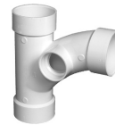
Part No. PVC 515 Combination Wye & 1/8 Bend (with Left Side Inlet) (ALL HUB)