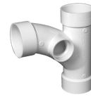
Part No. PVC 516 Combination Wye & 1/8 Bend (with Right Side Inlet) (ALL HUB)